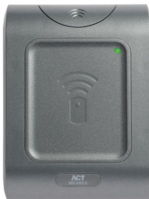
Product Code ACTpro MF 1040e Surface/Flush Mount Proximity Reader