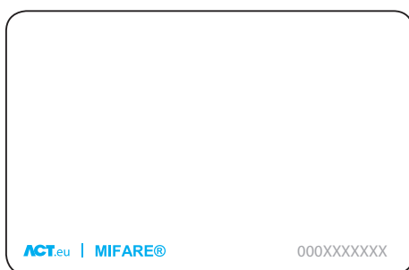
Product Code ACTpro MF Card MIFARE CARD