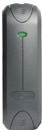
Product Code ACTpro MF 1030e Mullion Proximity Reader

1030e, 1030PM, 1040e, 1050e & USB Reader