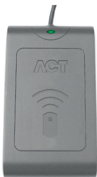
Product Code ACTpro USB Reader USB MIFARE Reader