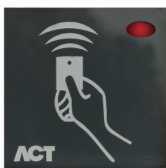
Product Code ACTpro MF 1030PM Panel Mount Proximity Reader