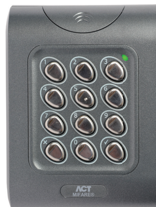
Product Code ACTpro MF 1050e Surface/Flush Mount PIN & Proximity Reader