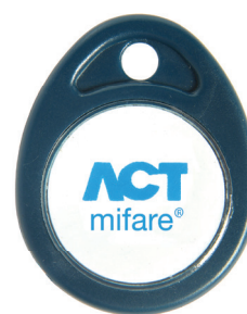
Product Code ACTpro MF Fob MIFARE FOB

All ACT products can be purchased through a network of distributors which can be found listed on the ACT.eu homepage.