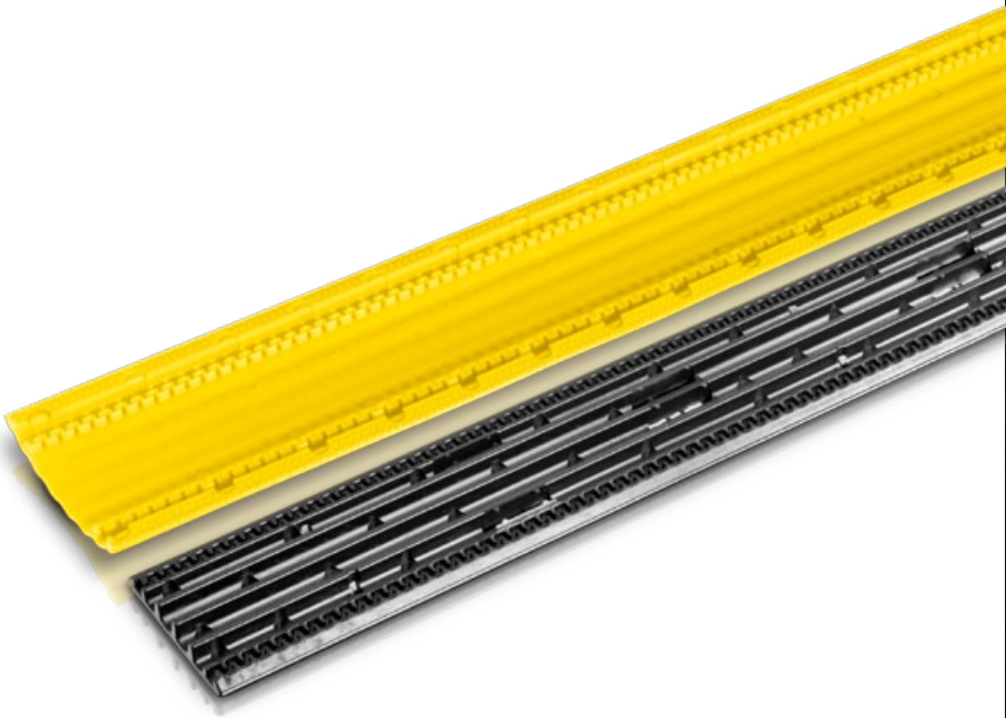
Art. No. 85161GREY