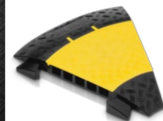
Art. No. 85308