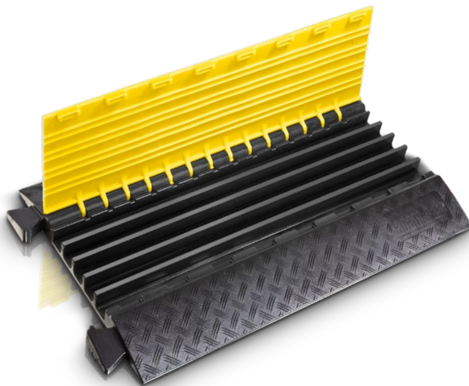
Art. No. 85310