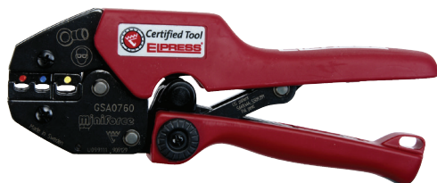
Certified Crimping tool GSA0760, crimp area 0.5-6 mm 2