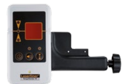
RangeXtender RX 40 including universal mount + batteries