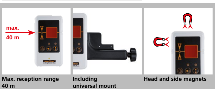
Max. reception range 40 m