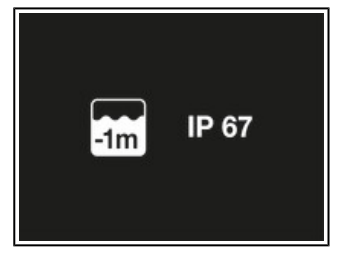
Dustproof and waterproof (in 1 meter of water for 30 minutes).