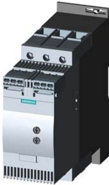
SIRIUS SOFT STARTER, SIZE S2, 45A, 22KW/400V, 40 DEGREES, 200-480V AC, 24V AC/DC, SPRING-LOADED TERMINALS