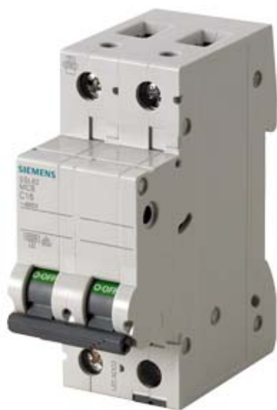
CIRCUIT BREAKER 230V 6KA, 1+N-POLE, B, 50A