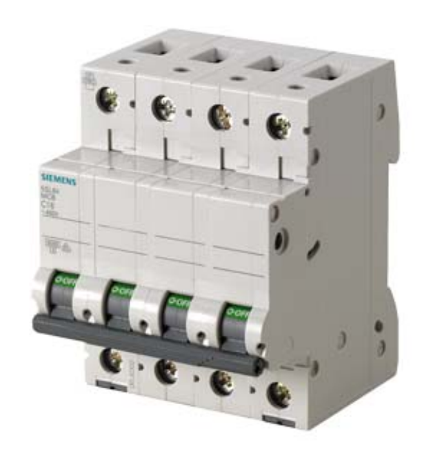
Similar to image