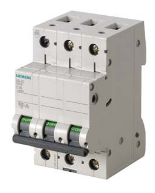
Similar to image