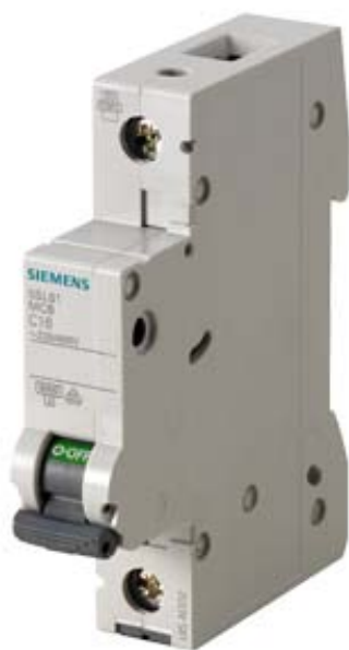
CIRCUIT BREAKER 230/400V 6KA, 1POLE, B, 63A