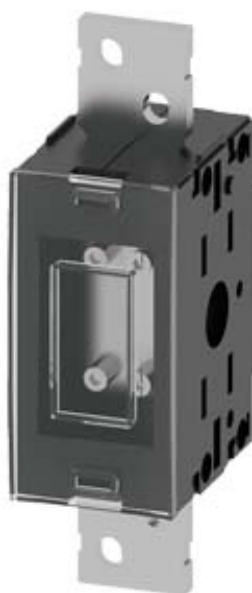
ACCESSORY FOR 3KD FRAME SIZE 5 NEUTRAL TERMINAL WITH REMOVABLE JUMPER FLAT TERMINAL