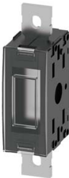
ACCESSORY FOR 3KD FRAME SIZE 4 N/PE TERMINAL WITH PERMANENT JUMPER FLAT TERMINAL