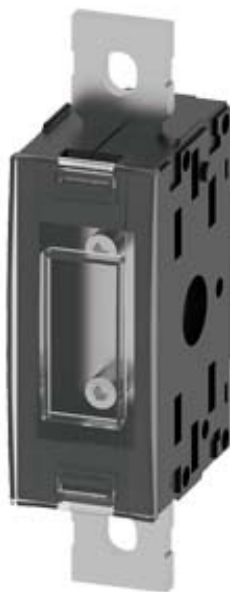
ACCESSORY FOR 3KD FRAME SIZE 4 NEUTRAL TERMINAL WITH REMOVABLE JUMPER FLAT TERMINAL