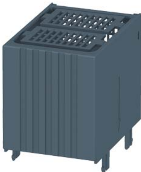
ACCESSORY FOR 3KD FRAME SIZE 4 CABLE CONNECTION COVER SHORT VERSION CONTAINS 8 PC