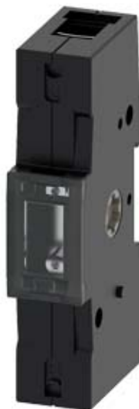
ACCESSORY FOR 3KD FRAME SIZE 2 NEUTRAL TERMINAL WITH REMOVABLE JUMPER BOX TERMINAL