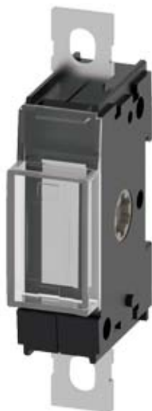
ACCESSORY FOR 3KD FRAME SIZE 2 N/PE TERMINAL WITH PERMANENT JUMPER FLAT TERMINAL