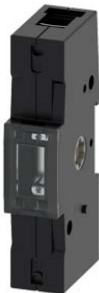
ACCESSORY FOR 3KD FRAME SIZE 2 N/PE TERMINAL WITH PERMANENT JUMPER BOX TERMINAL