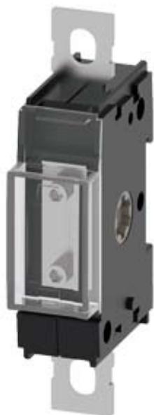
ACCESSORY FOR 3KD FRAME SIZE 2 NEUTRAL TERMINAL WITH REMOVABLE JUMPER FLAT TERMINAL