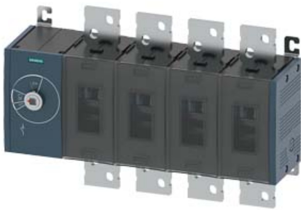
Similar to image

SWITCH-DISCONNECTOR 1000A, FRAME SIZE 5, 4-POLE FRONT OPERATING LEFT BASIC UNIT WITHOUT HANDLE FLAT TERMINAL