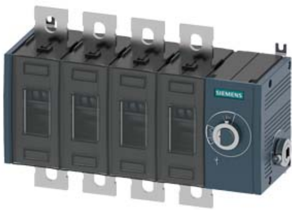
Similar to image

SWITCH-DISCONNECTOR 400A, FRAME SIZE 3, 4-POLE SIDE OPERATING RIGHT BASIC UNIT WITHOUT HANDLE FLAT TERMINAL