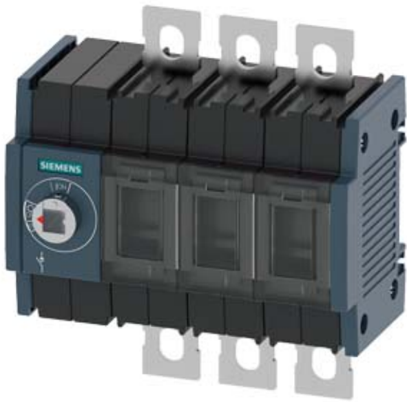
SWITCH-DISCONNECTOR 125A, FRAME SIZE 2, 3-POLE FRONT OPERATING LEFT BASIC UNIT WITHOUT HANDLE FLAT TERMINAL INCL. PHASE BARRIERS