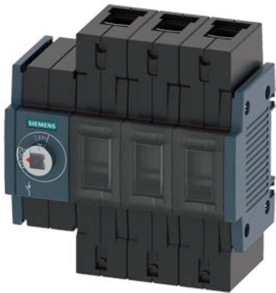
SWITCH-DISCONNECTOR 100A, FRAME SIZE 2, 3-POLE FRONT OPERATING LEFT BASIC UNIT WITHOUT HANDLE BOX TERMINAL