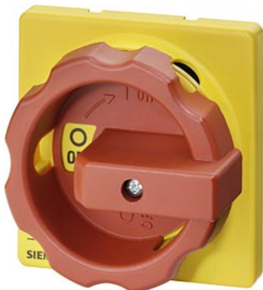
ROTARY ACTUATOR RED/YELLOW FOR SWITCH 3LD2, 63A FOR FRONT MOUNTING CENTRAL-HOLE MOUNTING