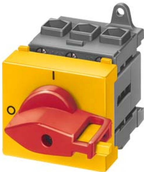
MAIN/EMERG. STOP SWITCH 3-POLE IU=100, P/AC-23A AT 400V=37KW FLOOR MOUNTING DIN RAIL/TWO-HOLE MOUNTING KNOB RED/YELLOW (EMERG. STOP)