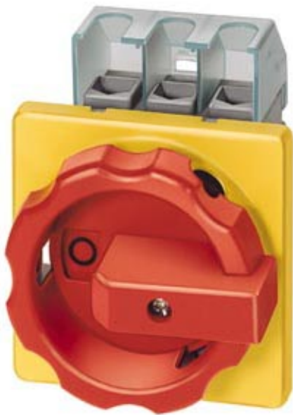
EMERG. STOP SWITCH 3-POLE IU=32, P/AC-23A AT 400V=11.5KW FRONT MOUNTING CENTER HOLE MOUNTING ROTARY ACTUATOR RED/YELLOW (EMERG. STOP)