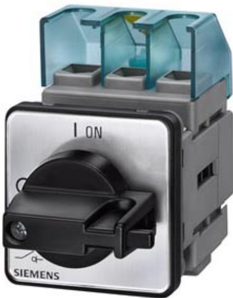
MAIN/EMERG. STOP SWITCH 3-POLE IU=32, P/AC-23A AT 400V=11.5KW FRONT MOUNTING FOUR-HOLE MOUNTING KNOB RED/YELLOW (EMERG. STOP)