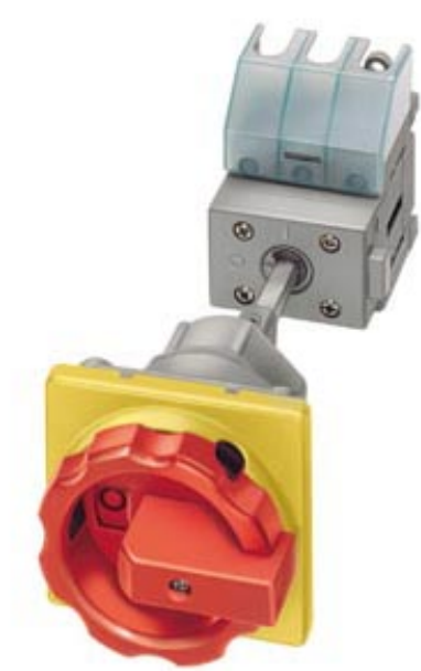
MAIN CONTROL SWITCH 3-POLE IU=32, P/AC-23A AT 400V=11,5KW BASE MOUNTING MOUNTING RAIL/TWO-HOLE MOUNTING ROTARY ACTUATOR BLACK