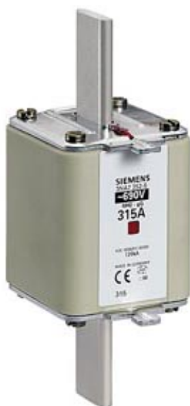
LV HRC FUSE LINK GL/GG WITH NON-INSULATED GRIP LUGS WITH COMBINATION INDICATOR SIZE 2, 315A, AC 690V/DC 440V