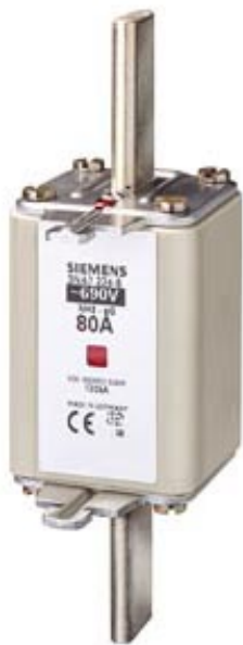
LV HRC FUSE LINK GL/GG WITH NON-INSULATED GRIP LUGS WITH COMBINATION INDICATOR SIZE 2, 80A, AC 690V/DC 440V