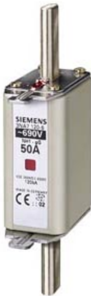
LV HRC FUSE LINK GL/GG WITH NON-INSULATED GRIP LUGS WITH COMBINATION INDICATOR SIZE 1, 200A, AC 690V/DC 440V