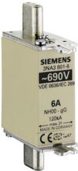
LV HRC FUSE LINK GL/GG WITH NON-INSULATED GRIP LUGS WITH FRONT INDICATOR SIZE 000, 6A, AC 690V/DC 250V