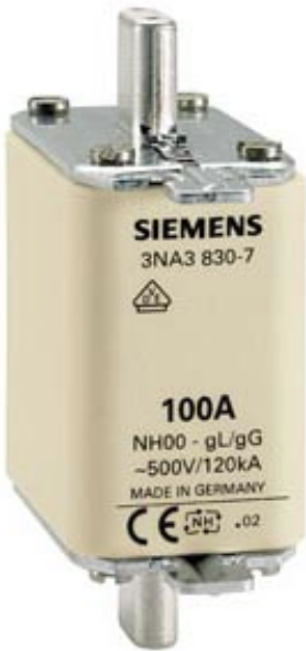
LV HRC FUSE LINK GL/GG WITH NON-INSULATED GRIP LUGS WITH FRONT INDICATOR SIZE 00, 100A, AC 500V/DC 250V