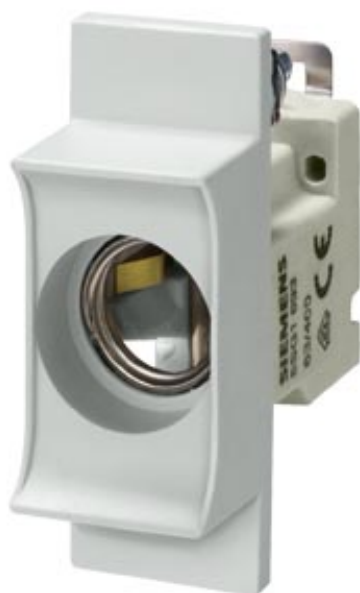
NEOZED BUILT-IN FUSE BASE WITH ISO SINGLE COVER D01/16 A 1-POLE, SNAP-ON MOUNTI