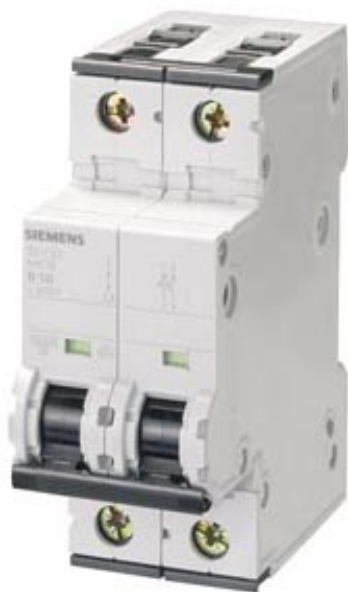
CIRCUIT BREAKER 400V 6KA, 2-POLE, B, 10A, D=70MM