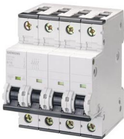
CIRCUIT BREAKER 400V 6KA, 4-POLE, C, 13A, D=70MM