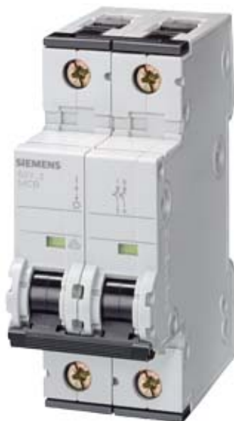
CIRCUIT BREAKER 230V 15KA, 1+N-POLE, C, 10A, D=70MM