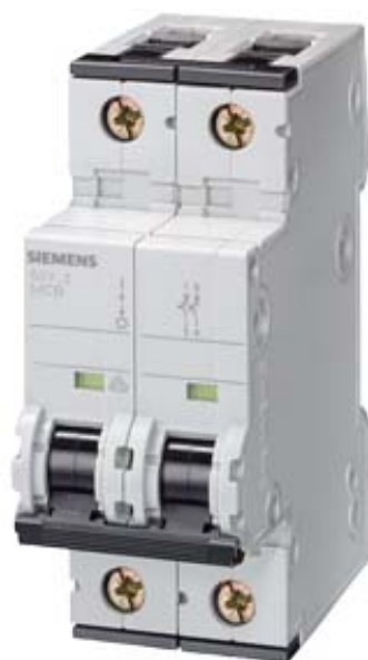
CIRCUIT BREAKER 400V 15KA, 2-POLE, D, 6A, D=70MM