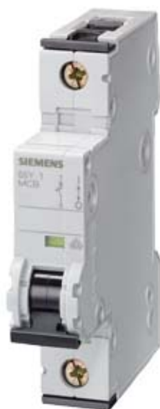
CIRCUIT BREAKER 230/400V 15KA, 1-POLE, C, 25A, D=70MM