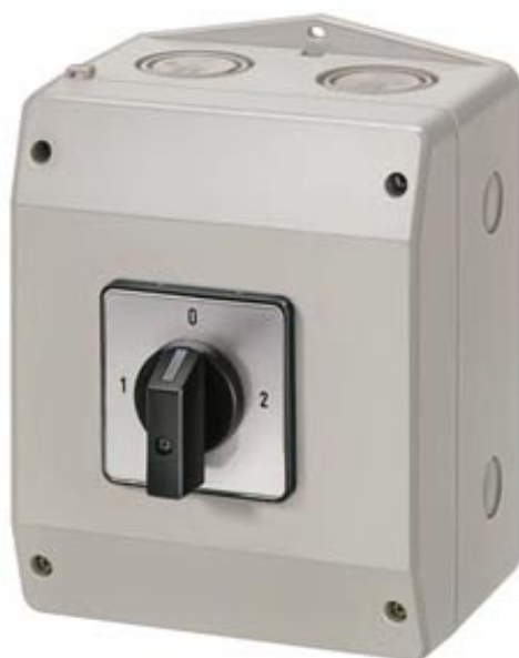
CHANGEOVER SWITCH 3-POLE IU=63, P/AC-23A AT 400V=22KW 2 N-TERMINAL MOULDED- PLASTIC ENCLOSURED, IP65