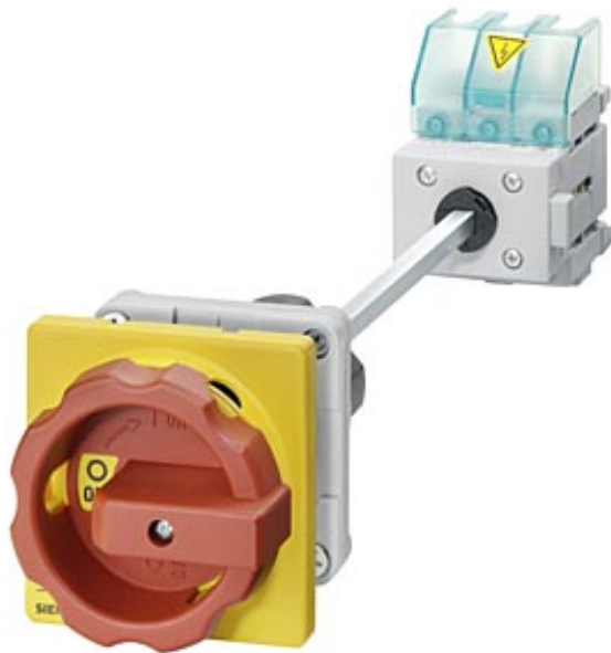
EMERG. STOP SWITCH 4-POLE IU=25, P/AC-23A AT 400V=9.5KW FLOOR MOUNTING DIN RAIL/TWO-HOLE MOUNTING ROTARY ACTUATOR RED/YELLOW (EMERG. STOP)