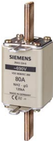
LV HRC FUSE LINK GL/GG WITH NON-INSULATED GRIP LUGS WITH FRONT INDICATOR SIZE 2, 80A, AC 690V/DC 440V