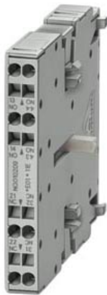
ELECTRONIC AUXILIARY SWITCH DIN EN 50012 LATERAL, CAGE CLAMP CONN. 1NO+1NC, SEALED, SIZE S0...S3