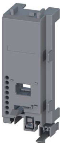
CONTACTOR BASE, FOR CONTACTOR SIZE S00 W.SCREW/SPRING- LOADED CONNECTION SINGLE-UNIT PACKING