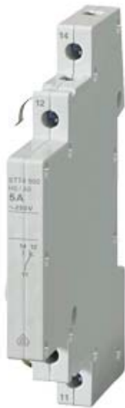
AUXILIARY SWITCH WITH 1 NO AND 1 NC CONTACT FOR AC 230V FOR 5TT41 OR 5TT42