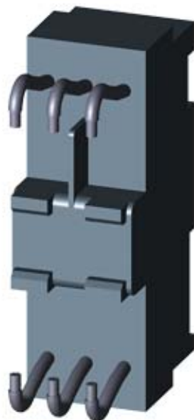
ADAPTER 45 MM FOR MOTOR STARTER PROTECTOR 3RV102. CABLE CROSS-SECTION AWG10