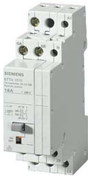
REMOTE SWITCH 1 NO CONTACT CENTRAL AND COMBINED CIRCUIT CONTACT FOR AC 230,400V 16A ACTIVATION AC 230V