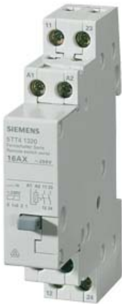
REMOTE SWITCH 2 NO CONTACTS SERIE CONTACT FOR AC 230,400V 16A ACTIVATION AC 12V