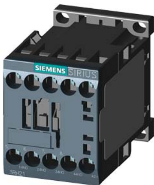
CONTACTOR RELAY, 4NO, DC 12V, SIZE S00, SCREW TERMINAL