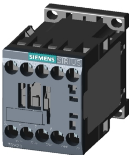
CONTACTOR RELAY, 2NO+2NC, DC 48V, SIZE S00, SCREW TERMINAL